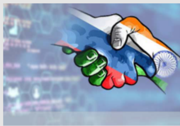
Russia lures Indian investors to explore economic potential of Ryazan Province connecting Europe

Mumbai, April 20 (KNN) In an effort to deepen its ties with India amid western sanctions, the Russian Government has invited Indian investors to explore the economic potential of Ryazan Province which is connected to Europe along with China, Mongolia and Kazakhstan.